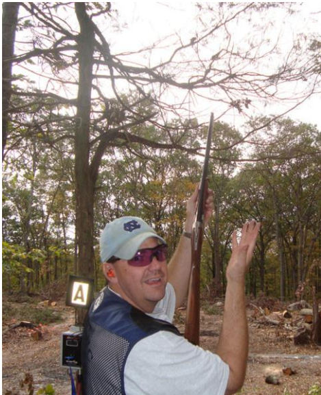
The infamous station 11