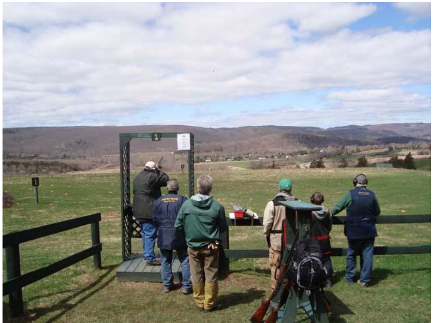
Infamous Station 6

Another station that we don't see in action too much was "Stonehenge" at station nine. As you step up to the box, you are presented with about a dozen artfully placed rock outcroppings. The targets were not as beautiful as we had a pair of black standards on report. The first bird was a left to right quartering away target that followed the slope of a hill. It's report was a nice feel-good target that was a high incomer that showed belly for a long time as it was slowing down.